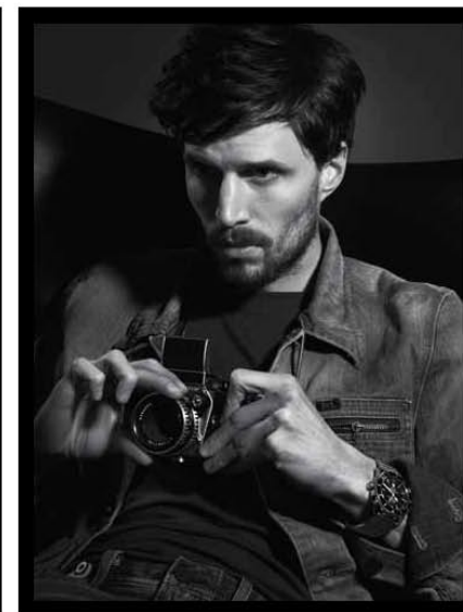
BREITLING SUPER OCEAN HÉRITAGE 46, 46-MILLIMETRE STAINLESS STEEL CASE, AUTOMATIC CHRONOMETER MOVEMENT WITH DATE, UNIDIRECTIONAL TURNING BEZEL, WATER RESISTANT TO 200M/208AR, PRICE AROUND 3,340 EUROS.